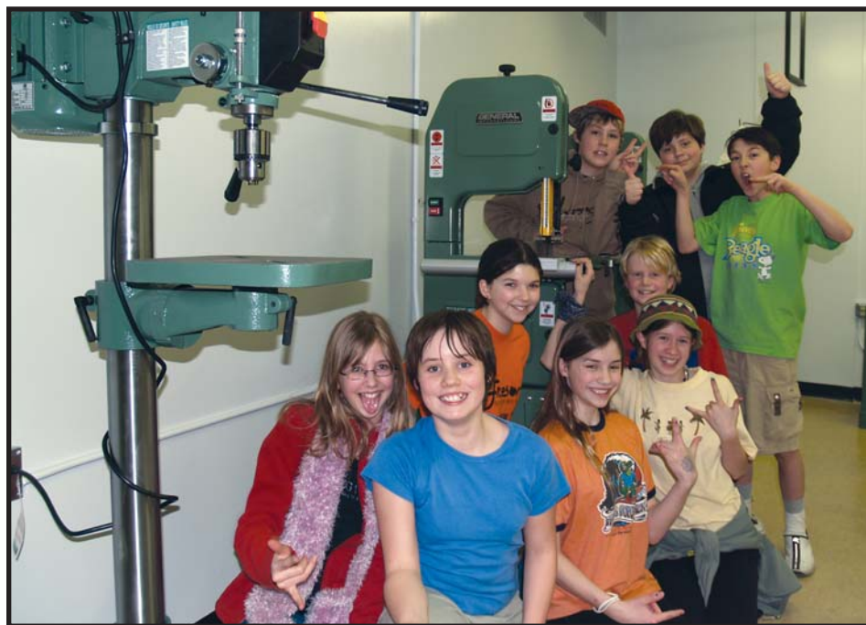
Grade 7 students admiring our new shop equipment.