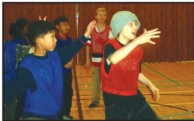
Here are the Grade 5s playing their new favourite game of Hollandball!