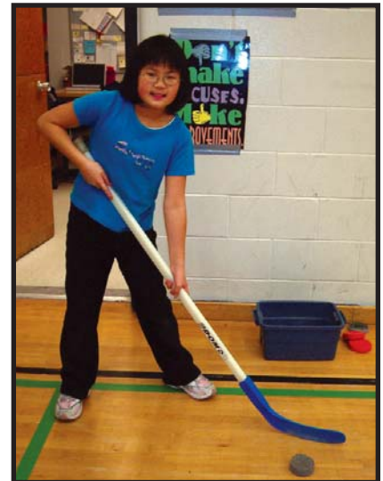
The Grade 4s are ready for an exciting floor hockey unit.